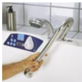
The support handle gives the resident increased support and security.