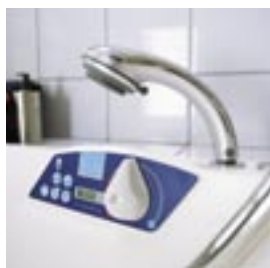
The built-in mixer for filling and showering makes the bath easy to use, and also simplifies the installation procedure.