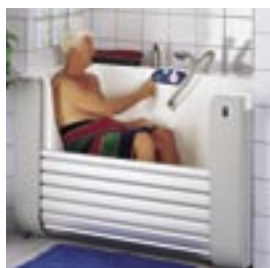
The unique Roll-Door of the Freedom Bath makes the entry and exit easy and safer than in standard bath tubs.

The built-in mixer for filling and showering makes the bath very easy to install – you simply connect the unit to the power, the mains water supply and drainage.