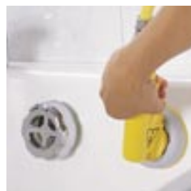
The air-spa lines are easily disinfected with the disinfection docking handle. Hydromassage lines and pump are easily disinfected with the optional surekleen system.