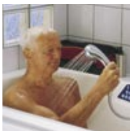
The built-in shower handle is comfortable and always within easy reach.