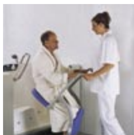
The Freedom Bath is available with a lift accessible option, making it possible for people who need assistance to enjoy a relaxing bath.