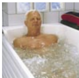
The Freedom Bath is available with hydromassage or air-spa for an enhanced bathing experience.